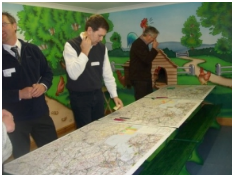
Distribution mapping – workshop March 2008